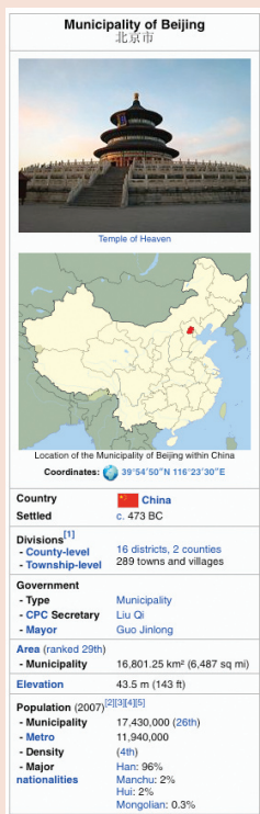
Figure 2: Sample Wikipedia infobox and the attribute/value data used to generate it.

For a given relation, the set of generic patterns was used to automatically instantiate relation-specific extraction rules, which were then used to learn domain-specific extraction